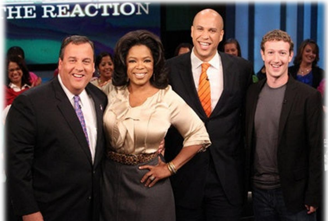
From Left to Right: Gov. Chris Christie, Oprah Winfrey, Newark Mayor Corey Booker and Facebook CEO Mark Zuckerberg.